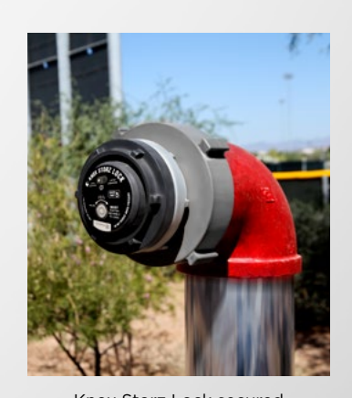
Knox Storz Lock secured onto a large FDC