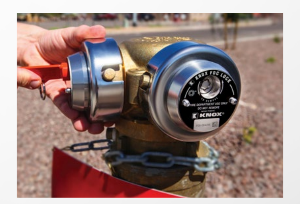
Knox FDC Lock with Swivel-Guard™ locked onto siamese connection