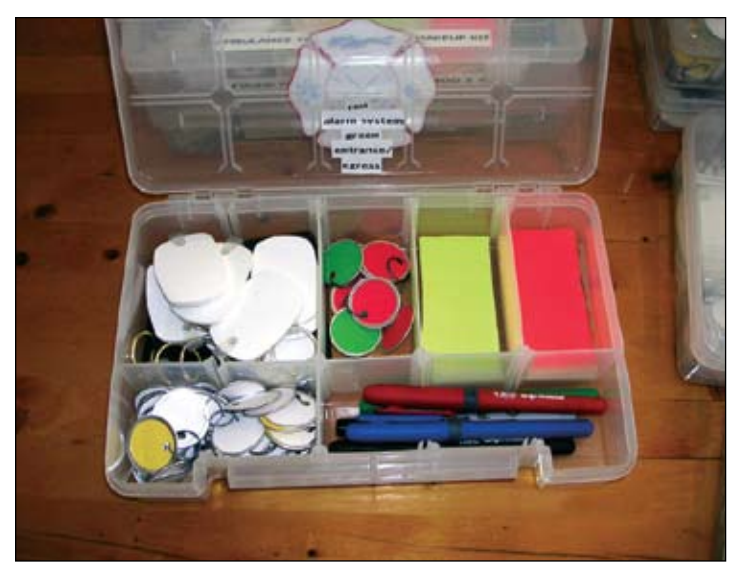
Fire inspection make-up kit.

Westminster has taken their Knox Program and adapted it to fit their community's needs. Their program has grown and evolved right along with their community.