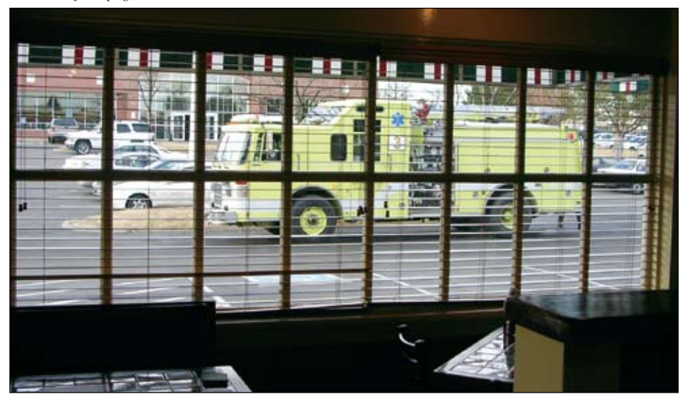
Westminster Fire Department at a Knox-Box inspection.

because some business owners have actually removed the hooks not knowing they were to hold the keys. "The kit is pretty simple. It has everything needed to keep the box updated," explained Rosenberger.